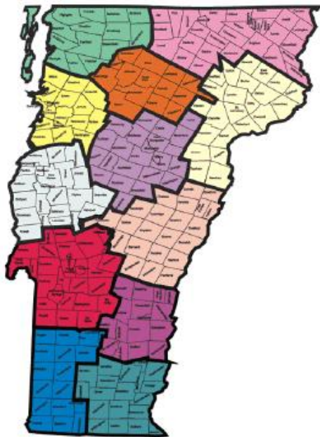
Agency of Human Services Health Districts

The enactment of Act 150 is a huge victory for the Parent Child Center Network. Since the establishment of Parent Child Centers in Vermont statute in the late 1980's, the Network of providers has worked to establish consistency and quality in service delivery for families across the state, and it is significant to have a bill that reflects this new level of formality into statute. Specifically, the Parent Child Center bill proposes to: 1) establish in statute the Parent Child Center Network to ensure accountability among and distribute funding to designated Parent Child Centers; 2) amend the criteria for designation as a Parent Child Center; and 3) require a report on the amount of an annual inflation factor to monies if applied to the base funding appropriated to the Parent Child Center Network. You can read the bill summary here .